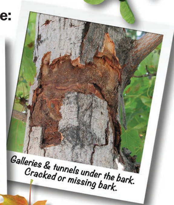
Galleries & tunnels under the bark. Cracked or missing bark.