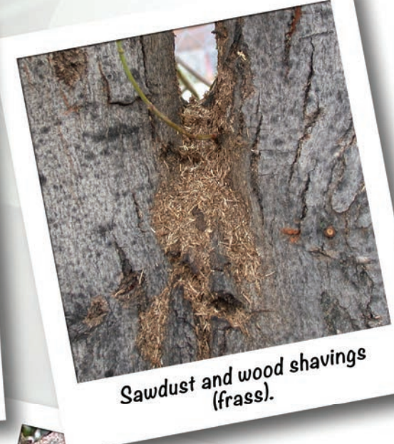
Sawdust and wood shavings (frass).