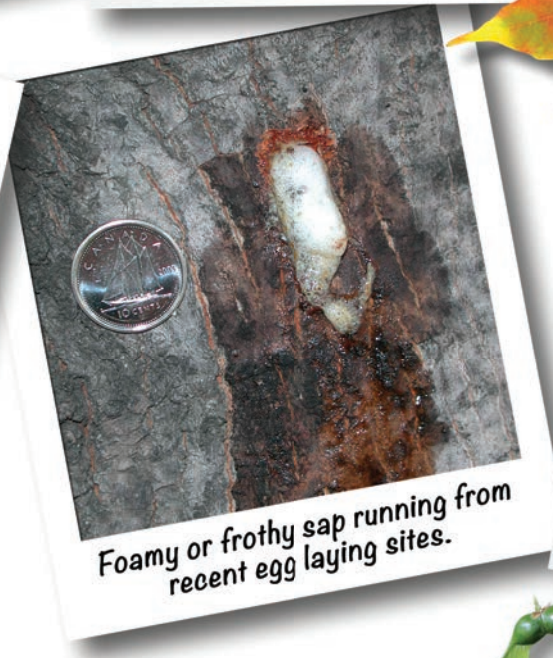
Foamy or frothy sap running from recent egg laying sites.