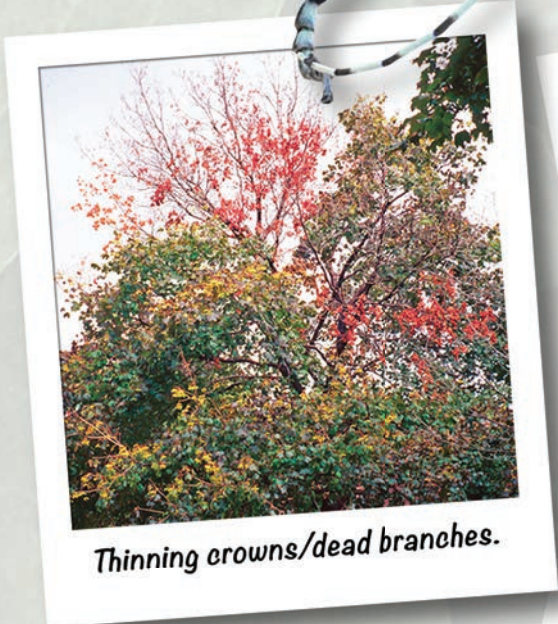
Thinning crowns/dead branches.