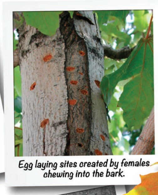
Egg laying sites created by females chewing into the bark.