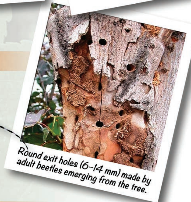
Round exit holes (6–14 mm) made by adult beetles emerging from the tree.