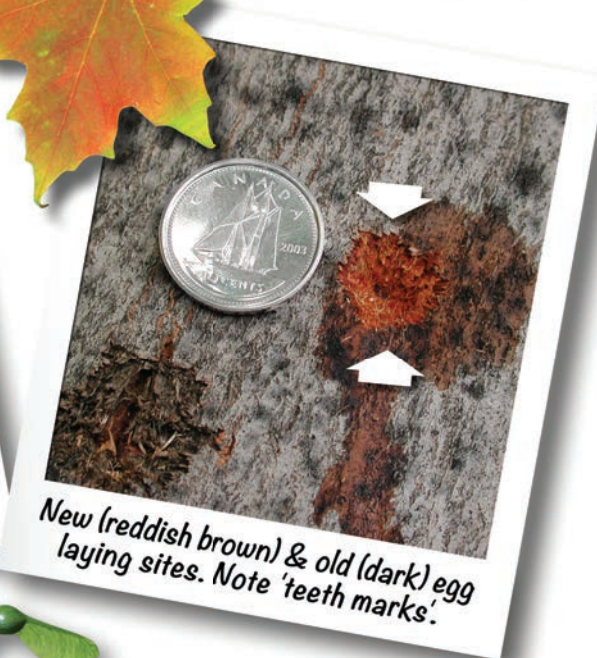
New (reddish brown) & old (dark) egg laying sites. Note 'teeth marks'.